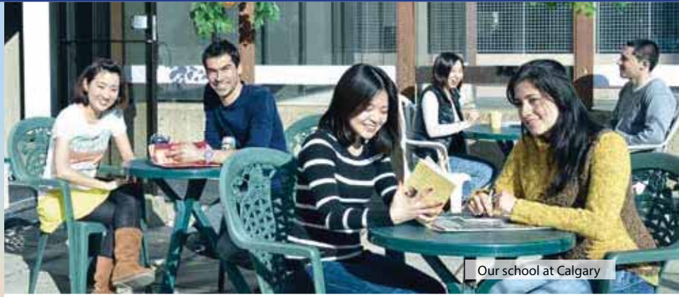
Our school at Calgary