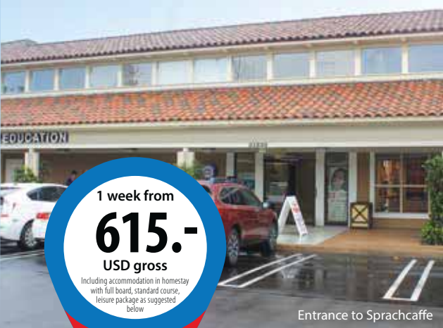
Entrance to Sprachcaffe