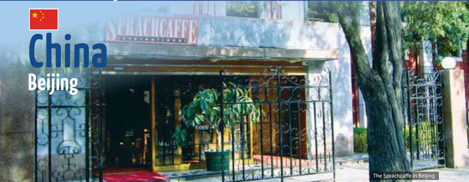
The Sprachcaffe in Beijing