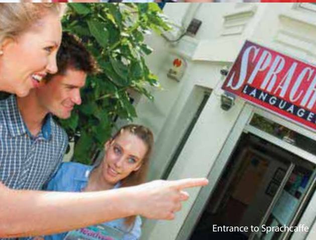
Entrance to Sprachcafe